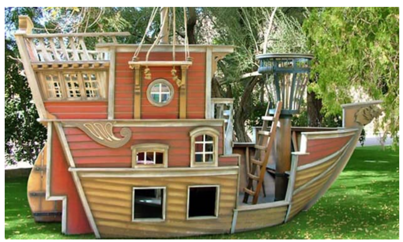
Constructed of mahogany and steam-curved poplar planks, this 12' x 18' playhouse—which boasts leatherette-cushioned sleeping bunks, a waterproof roof, cannonball-riddled mast and rigging, and upper and lower decks constructed from Douglas fir—goes for a whopping $52,000 (to the luckiest kid in the room).