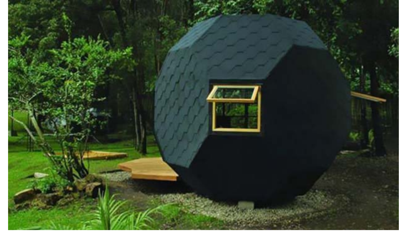
Designed by Manuel Villa, this nature-surrounded dwelling—built in a family's garden in Bogota, Colombia—is meant to embrace both children and adults alike while acting as an independent space from day-to-day activities.