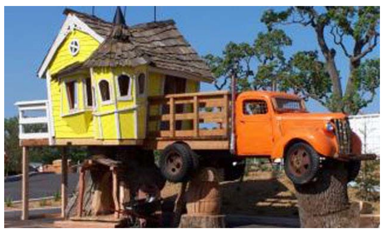
This truck-crossed tree house—featuring a Victorian-style clubhouse and truck-bed balcony—allows kids a place to relax and, better yet, experience stationary adventures in the driver's seat of the playhouse's orange truck.