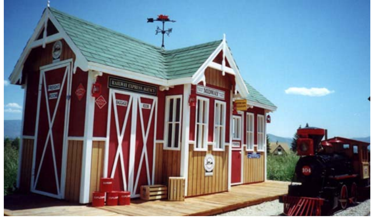
Built in 2001 in Heber City, Utah, by Devrle Wells, who's the former owner of WoodManor Playhouses, this little red residence is the perfect escape for any young kid who loves locomotives.