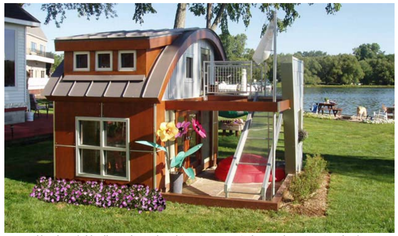
Designed by Bloomfield Hills, Michigan—based AZD Associates Architects, this 10' x 10' castle—featuring a curved metal roof, electric heat, built-in TV/DVD and creativity station—is a far cry from the sheet-shantied shacks of yesteryear; it was auctioned off for $30,000.