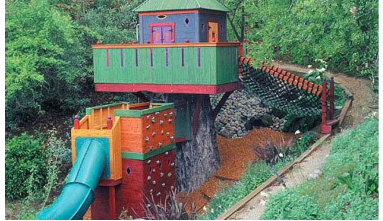
Perched atop a 9'-tall stump, this tree fort—built in 2003, also by Butler—sits in a deep ravine, and offers kids a Swinging Bridge, a Look-Out Deck, a Trap Door, a Catwalk, a Rock Climbing Tower and more.