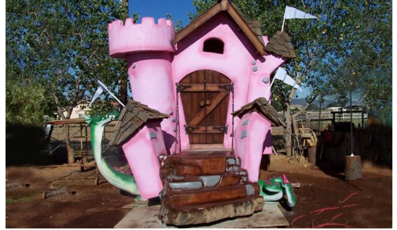
This pretty-in-pink princess castle, whose morphed features conjure up thoughts of a carnival funhouse, is made of redwood log and includes a drawbridge, a turbo spiral slide, faux rock accents, a redwood dragon carving and more—all perfect for summoning any prince for a playdate.