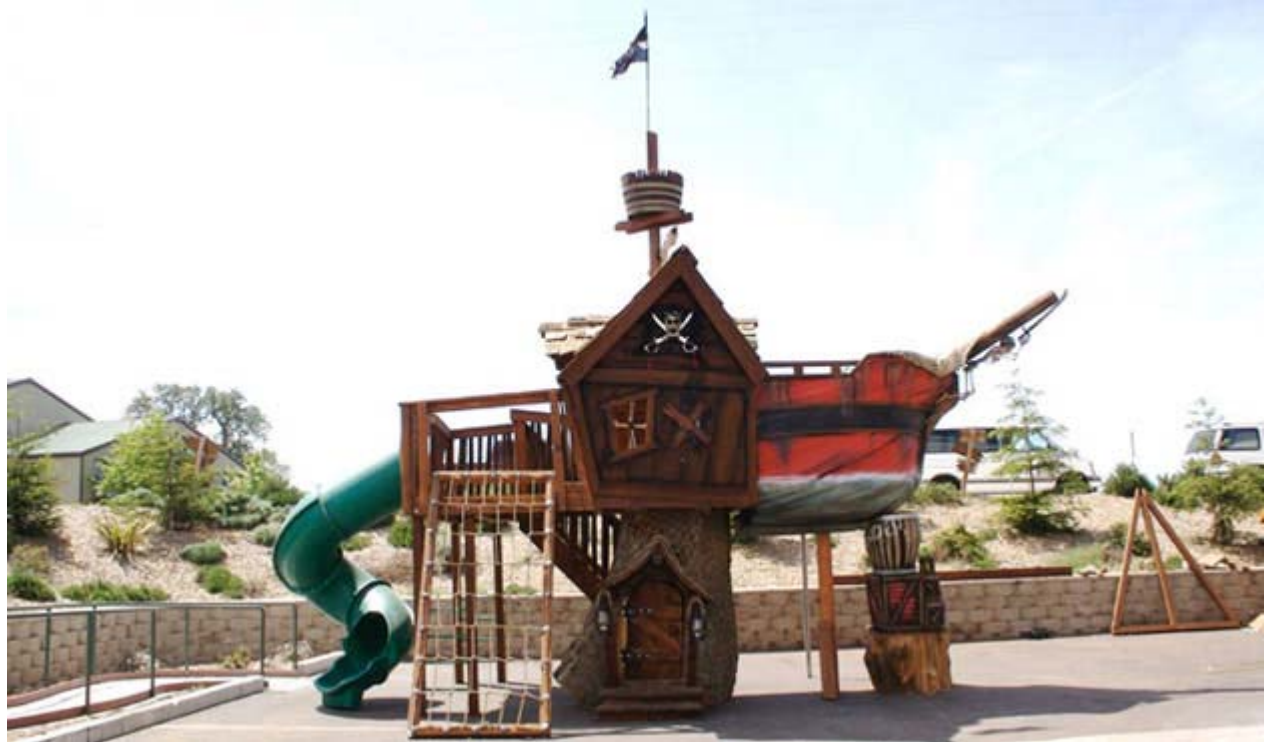
This Pirate-themed playhouse—from which protrudes an 8' x 6' galleon-style pirate bow—was available at Costco in 2006 for $18,499.99. Also included: An oversize log (of which no two were the same), swing, fireman's pole and ship's wheel.