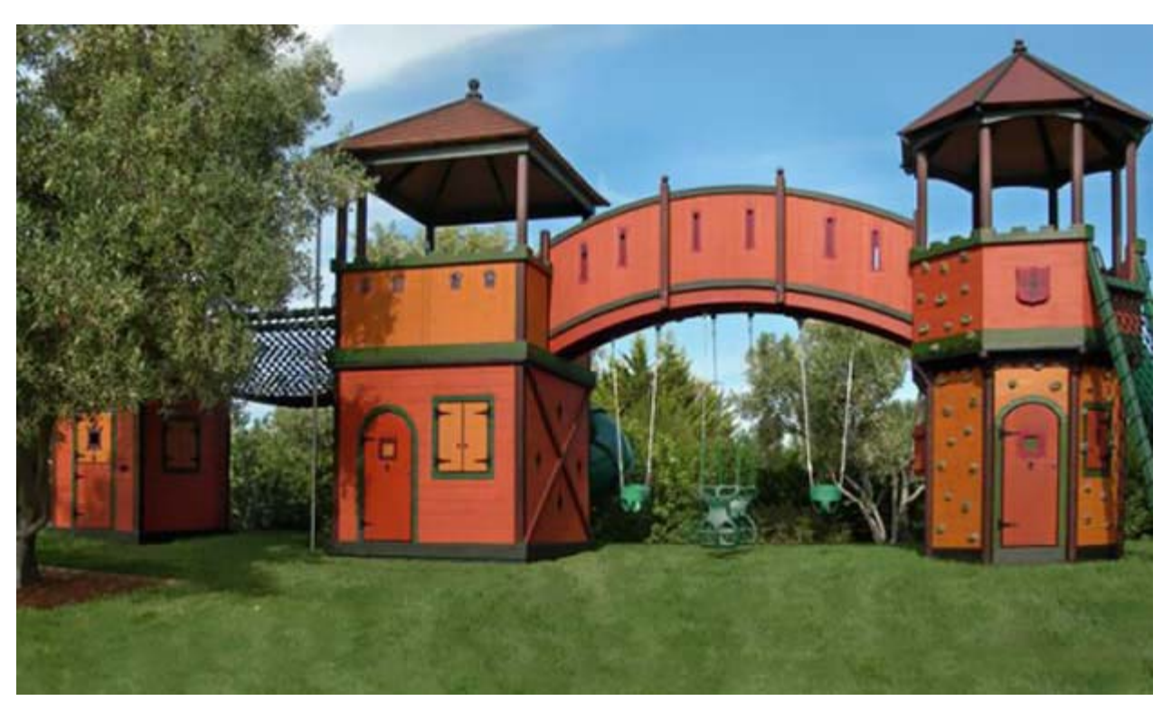
This 51'-long Butler-built playhouse—assembled in 2007 in Silicon Valley—summons a Mediterranean-inspired charm with its color palette and many bridges and hideaways. Photo courtesy of <u>Barbara Butler</u> .